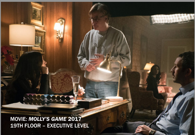
MOVIE: MOLLY'S GAME 2017 19TH FLOOR - EXECUTIVE LEVEL

The Ballroom has appeared in a variety of films including Take The Lead (2006), starring Antonio Banderas. The Ballroom was at one time, the most photographed room in Toronto, if not Canada.