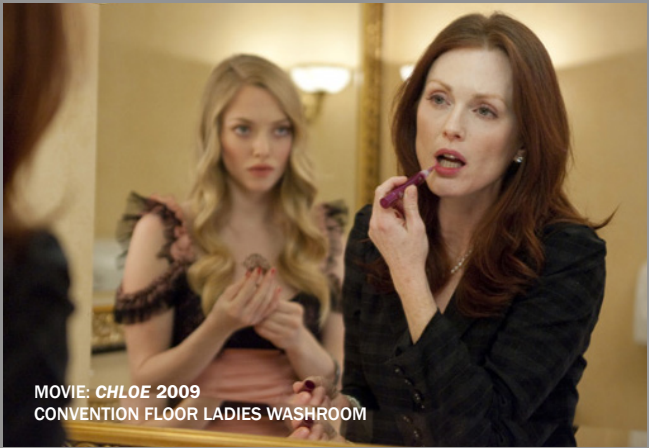
MOVIE: CHLOE 2009 CONVENTION FLOOR LADIES WASHROOM

The Concert Hall is a popular film setting. Recent movies with scenes filmed at the hotel include Serendipity (2001), The Tuxedo (2002), Cinderella Man (2005), Take the Lead (2006), Chloe (2009), RED (2010), Oscar winner Spotlight (2015), Molly's Game (2017) and Shazam! (2019).